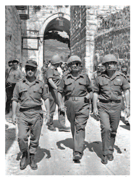
Israeli Troops led by Generals Moshe Dayan & Yitzhak Rabin entering the Old City of Jerusalem, 7<sup>th</sup> June 1967

Relative peace was enjoyed for a little over 10 years. But the underlying hatred of Israel continued, especially amongst Egypt and the displaced Palestinians. In May 1967, President Nasser sent Egyptian troops into Sinai and closed the 7-mile wide Straits of Tiran to Israeli shipping, thus stopping