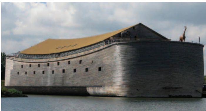
A scale replica of Noah's Ark, Ark van Noach, in the Netherlands.

It's been said before that the vast majority of life on this planet is in the sea. A few years ago, a scientist who believes in the Bible estimated that the