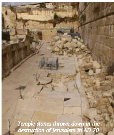
Temple stones thrown down in the destruction of Jerusalem in AD 70

With the temple destroyed, it was impossible to keep the Law of Moses properly, so temple worship was finished. In a more fundamental way,