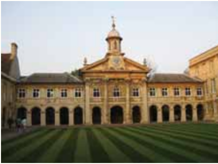
Emmanuel College, Cambridge: Lawrence Chadderton was its first Master.