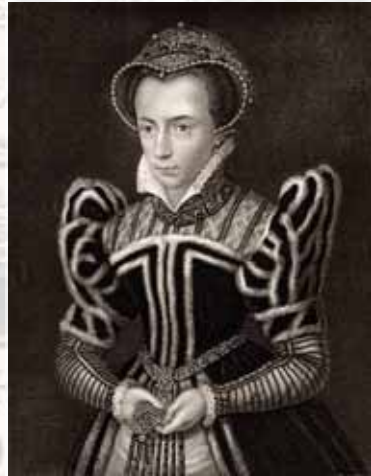
Queen Mary I – A Catholic Queen

On Edward's death in 1553, Queen Mary I came to the throne. Being a