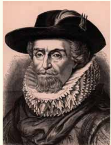
King James I of England

In 1603, James was met on his journey south from Scotland to London, by a Puritan lobby group. They presented the “Millenary Petition” signed by over 1000 churchmen demanding reforms in rites and ceremonies perpetuated in church