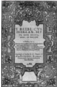
Frontispiece to the Welsh Bible of 1588

they were less widely publicised. The farmhouse featured on this month’s cover is located in a remote part of North Wales – in the upland valley of Wybrnant, Gwynedd. It was here in 1545 that William Morgan was born, the second of five children born to a tenant farmer and his wife. When he was twenty, William went to St John’s College, Cambridge, where he obtained several degrees and also learned Hebrew and Greek.