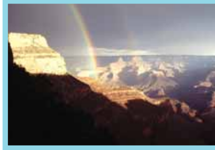
There is a new world coming in which everything will be made beautiful

“Behold, I make all things new” (Revelation 21:5).