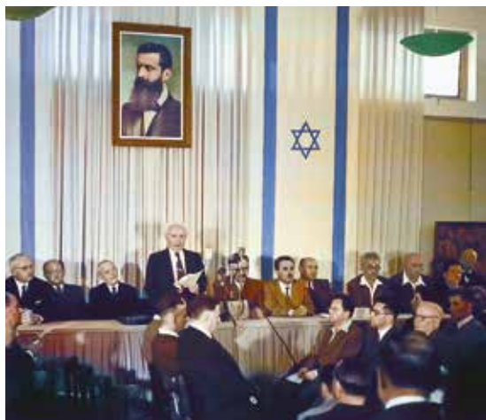
Declaration of the State of Israel, 14 th May 1948

These are the signs of the Lord's coming and of the end of the age. A proliferation of weapons on a scale and of a kind which could destroy the whole human race so that ' no human being would be saved '—such as has never happened before. And the fulfilment of the times of the Gentiles, when Jerusalem is again in the hands of the Jews.