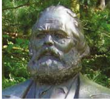
Monument to Karl Marx in Karlovy Vary, Czech Republic

THE REVOLUTIONARY philosopher Karl Marx was one of the most influential thinkers of modern times. He had a vision of a world where everyone is equal, the rich do not exploit the poor, and we all live together in harmony. He urged the workers of the world to rise up against their rulers and establish a people's utopia.