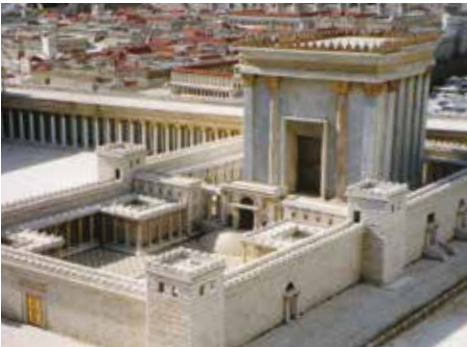
Model of the Temple at the time of Jesus (Israel Museum, Jerusalem)

THERE WAS AN OCCASION when Jesus' disciples pointed out to him the splendid buildings of the Jerusalem temple. It was one of the wonders of the ancient world, and the Jews were immensely proud of it.