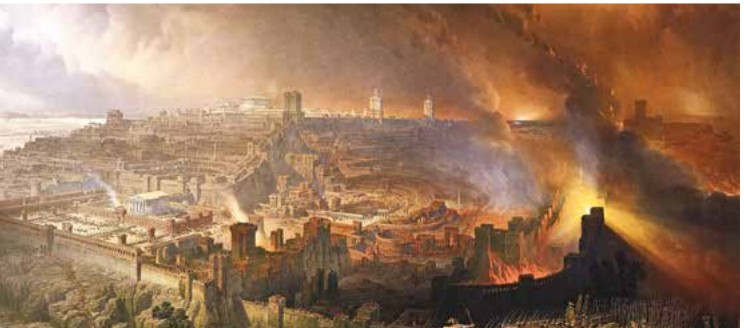
The destruction of Jerusalem, AD70

The important thing is that it is unique. We have never before had this power. Jesus said it would come and it was in reply to a question 'what will be the sign of your coming?' So here we have one unique event which cannot be confused with