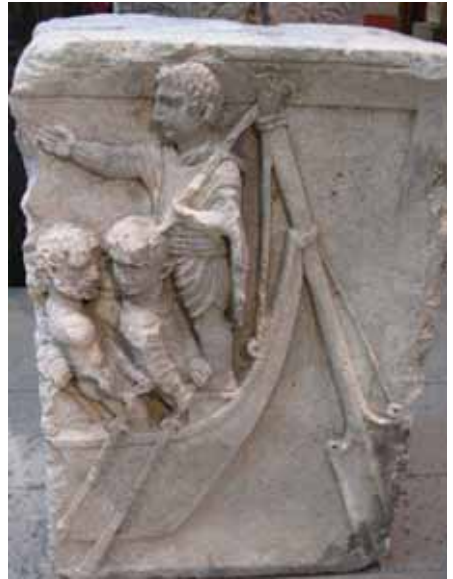
Part of the sculpture of a Roman ship showing how it was steered from the stern

They cast four anchors out of the stern to slow the ship's progress